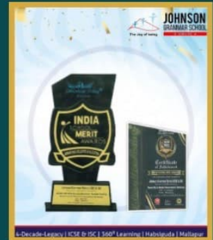
Johnson Grammar School ICSE and ISC India's top ICSE school ranking -Parameter wise Ranked no 1 in student advancement and mentoring

# Top 20 ICSE Schools - No. 2 in Hyderabad, No. 2 in Telangana & No. 8 in India.