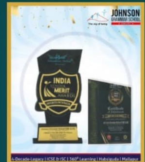
Johnson Grammar School ICSE and ISC India's top 20 ICSE schools Ranked no 2 in Hyderabad Ranked no 2 in Telangana Ranked no 8 in India