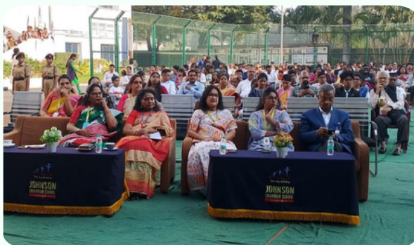
Dignitaries for the day