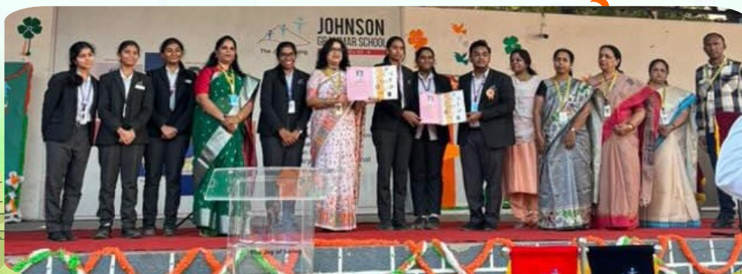
Cover Page Reveal of “Aura”

Click here to see the Republic day celebrations!