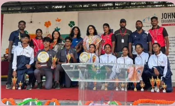
Sports Students received awards for their achievements